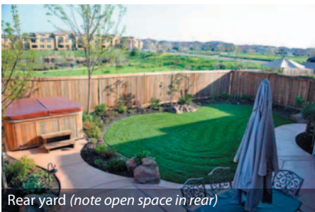
Rear yard (note open space in rear)