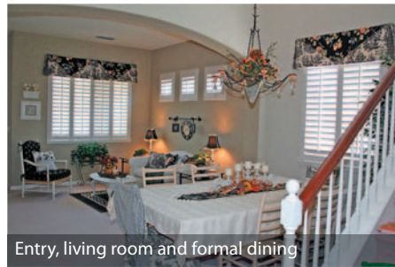
Entry, living room and formal dining