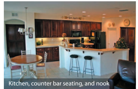
Kitchen, counter bar seating, and nook